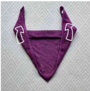
Fold the right and left points of the triangle up, making a wolf's head shape