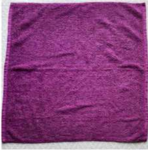
Lay the nappy out in a flat square