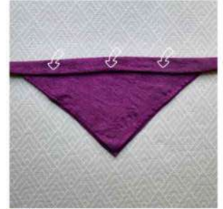
Fold the top long edge over about 3-4cm