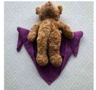
Place the baby on the nappy