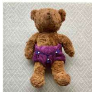
Sit back and admire your work