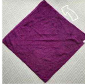
Rotate it 45 degrees so a point is facing you