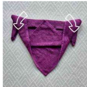
Fold the wolf's "ears" over and down, so it looks more like a dog's head