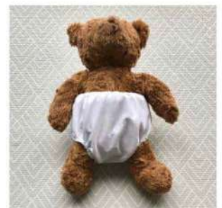
Before adding a waterproof wrap