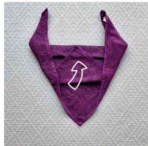
Fold one layer from the wolf's "nose" away from you, toward the long edge