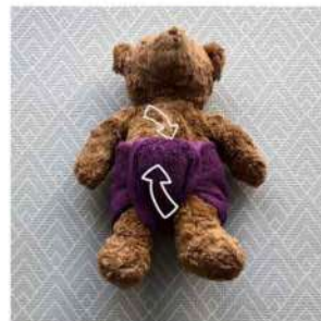
Bring the point up between the legs and then tuck down into the waistband