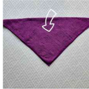
Fold it on the diagonal to make a triangle with the long edge at the top