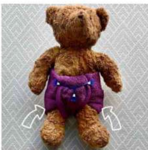
At the moment the nappy comes low down on the child's legs