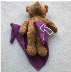
Fold the right wing over the child