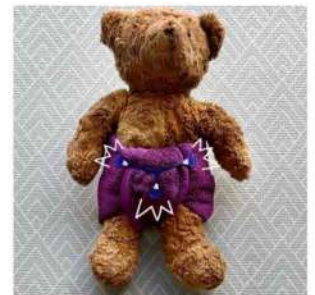
Secure with a nappy nipper