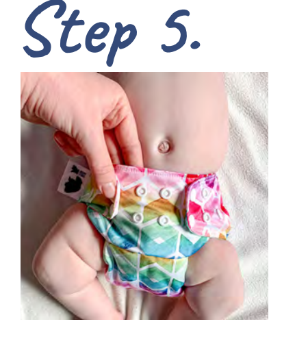
Check for a two finger gap