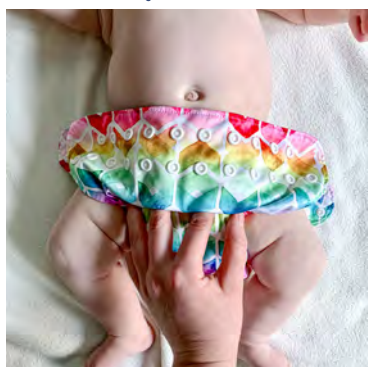
Fingers up to create a smooth line at the rise